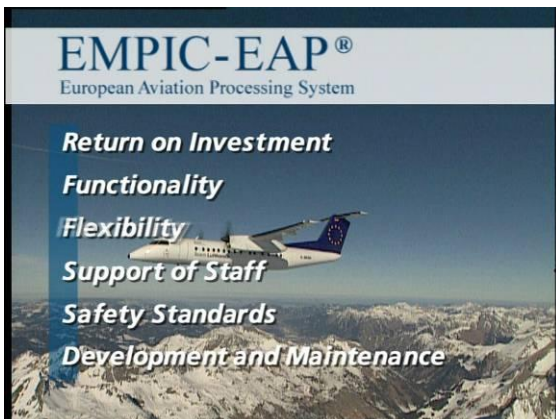
Statements about the benefits of EMPIC-EAP®

Both reference statements will also be available as long versions very soon. Order them on DVD or watch them as video streams at www.empic.de .