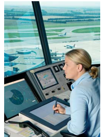
A new module of EMPIC to enhance safety in aviation!

trees, the customer can configure national and international regulations as "background knowledge". The benefit: Fulfilled and not fulfilled regulations will be displayed during the process of assigning a new licence to a person and the user avoids mistakes. All data of the complete "life-cycle" of the person are stored