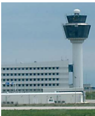
The name of the new airport of Athens: Eleftherios Venizelos.

The Hellenic Civil Aviation Authority in Athens, Greece, recently ordered an extension of the medical solution (FCL-M) from EMPIC GmbH. The order has already been carried out and the customer will migrate to the new solution soon.